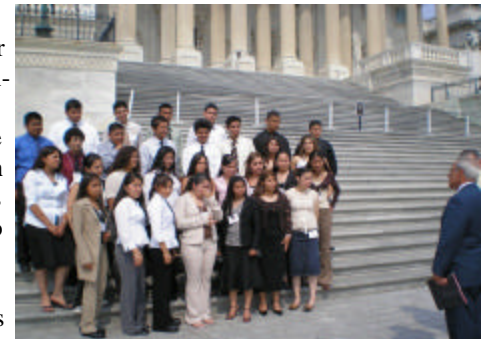
U.S. Congressman Solomon Ortiz speaks with delegates on the steps of the Capitol.