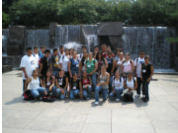
Region 1 Students at the Franklin Delano Roosevelt Memorial.

These issues, concerns and proposed solutions were developed by EIDLDP Class 153. Their purpose is to make a difference in their communities and make their communities a better place.