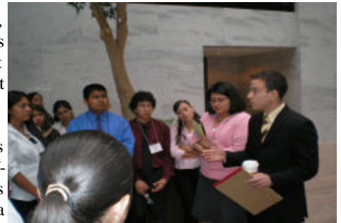
Legislative aides from Senator Barbara Boxer's office discuss the issues agenda and answer questions from the students.